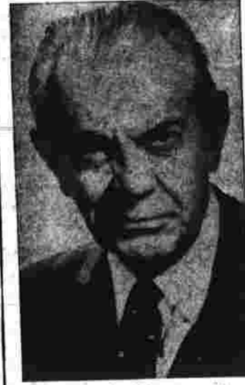
Raymond Massey is narrator on NBC's "The Capitol: Chronicle of Freedom" Tuesday 10-11 p.m.