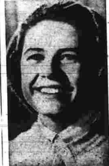
Patty Duke in ABC's 'The Patty Duke Show' Wednesdays 8-8:30 p.m.