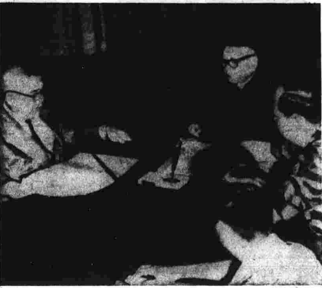
Lt. Gen. Nguyen Khanh, right, reaches for pen to sign communique which agrees to hand Viet Nam power back to civilian government after three weeks of military rule. From left at table are Premier Tran Van Huong, Phan Kac Suu, chief of state and Khanh.

HARTFORD (AP)—It took more than a wet December to make up for last year's drought. The U.S. Department of the Interior reported Friday that ground water in Connecticut was still at very low levels.