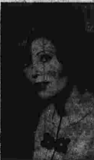
Jill St. John is in Bob Hope's Christmas special Friday on NBC 8:30-10 p.m.

"But she's skipping to the first grade," Bing added. "She knows too much and the teacher had to spank her three times for showing off her knowledge to the other kids."