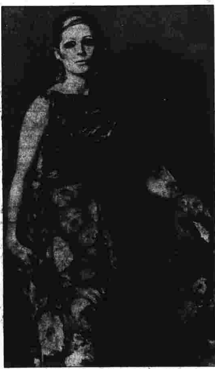
Pure silk chiffon printed in roses forms this evening dress by Gina for Gothe. It's designed with an asymmetric bodice and a panel floating from the shoulder.

By RHEA STEWART (Special Herald Reporter) NEW YORK—One fashion editor covering the Press Week of the New York Couture Group showed up wearing pants, the kind that Paris offered last season—tailored pants in ivory brocade wool with a matching jacket.